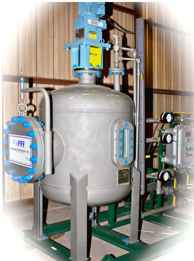
Portable Nutshell Filter capable of flow throughput of up to 20 m 3 /h. Skidded unit comes complete with all instrumentation and controls installed.

No Chemical Consumption – Normal operation requires no chemicals for filtering and no surfactants or additives to assist in the media scrubbing (Back washing).