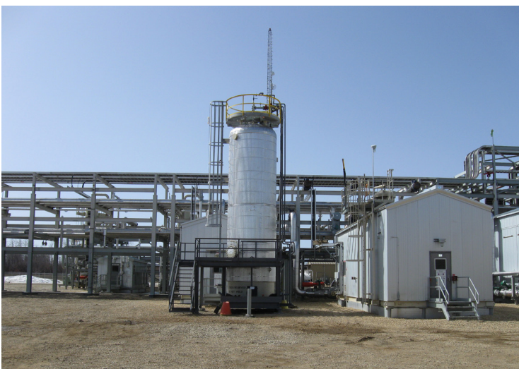
Figure 2. A PS-Filter activated carbon adsorber (separation) amine system.

Both filtration and separation are important processes, but they differ in their approach and in the level of efficiency that they provide.