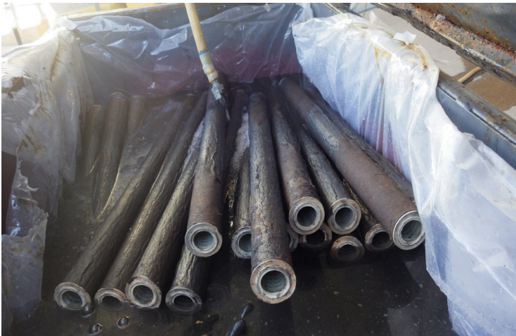
Figure 1. Spent amine cartridges, completely filled with solid contaminants.