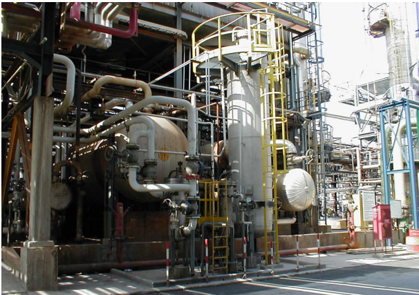
Figure 3. Amine gas treatment within a refinery.

One common problem in gas processing operations is amine foaming. As fine solids build up, the surface tension of the amine changes and foam becomes